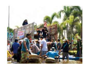
14 DISASTER RELIEF Our annual look at groups working with displaced populations