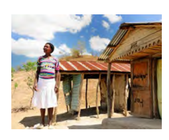
5 POVERTY Giving the most vulnerable a chance at economic security