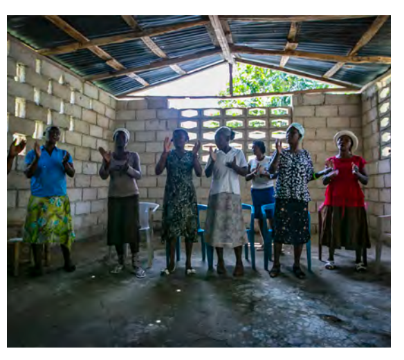
Shycanta Amy's Solidarity group sings a song during their monthly meeting.

To learn more about our poverty-defeating programs and services, visit the "What We Do" section of our website: fonkoze.org.