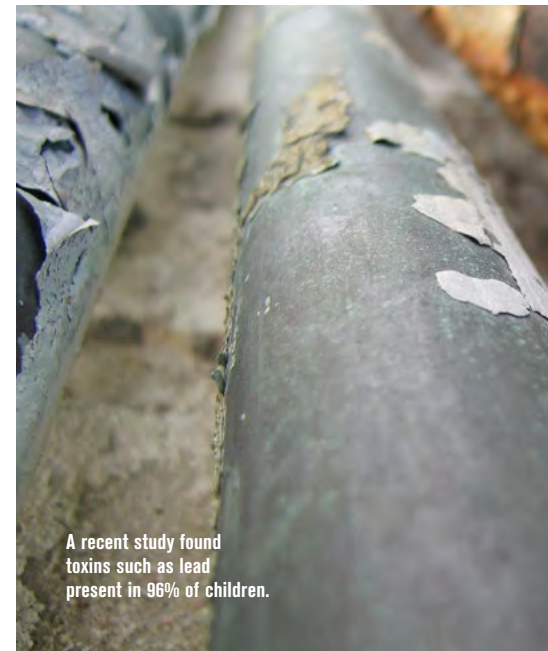
A recent study found toxins such as lead present in 96% of children.

Over 11 million parents, businesses, and healthcare professionals belong to the coalition Safer Chemicals, Healthy Families that advocates for the safer use of chemicals in homes, businesses, schools and household products. The coalition focuses on three areas to strengthen protection against toxic chemicals: stronger policies through advocacy; safer standards for retailers and manufacturers; and better information available to educate citizens. Safer Chemicals, Healthy Families also advocates for reform of the federal law Toxic Substances Control Act, which regulates the introduction of new or already existing chemicals.