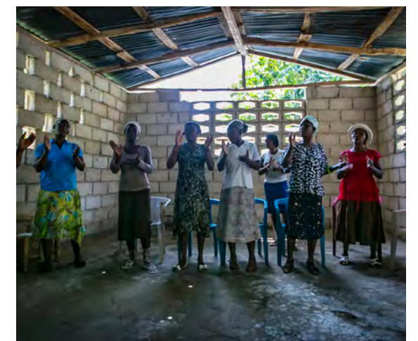
Shycanta Amy's Solidarity group sings a song during their monthly meeting.

Solidarity is Fonkoze's core lending program. It provides loans to groups of five women (called a Solidarity group), creating a built-in system of accountability and support. The loans (beginning at $45 and increasing to over $850) that are provided enable women who have already established themselves as micro-entrepreneurs to expand their businesses for long-term success.