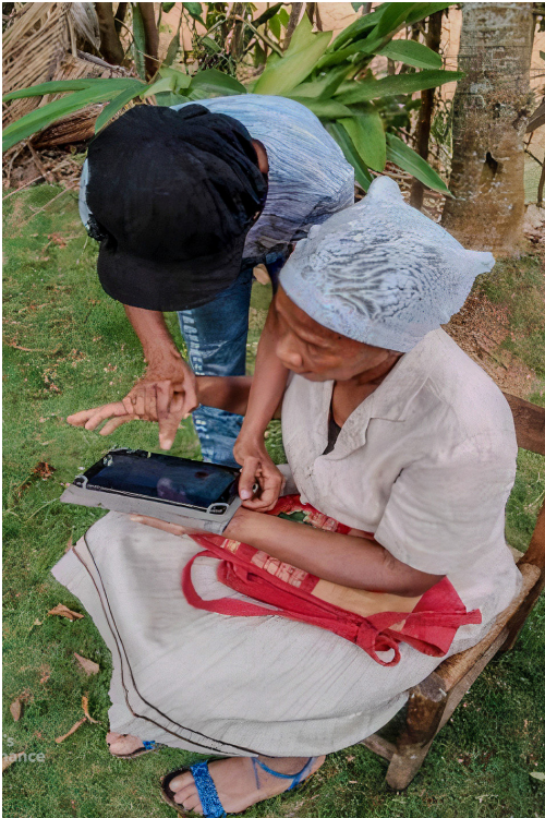
Picture taken by case manager in the field